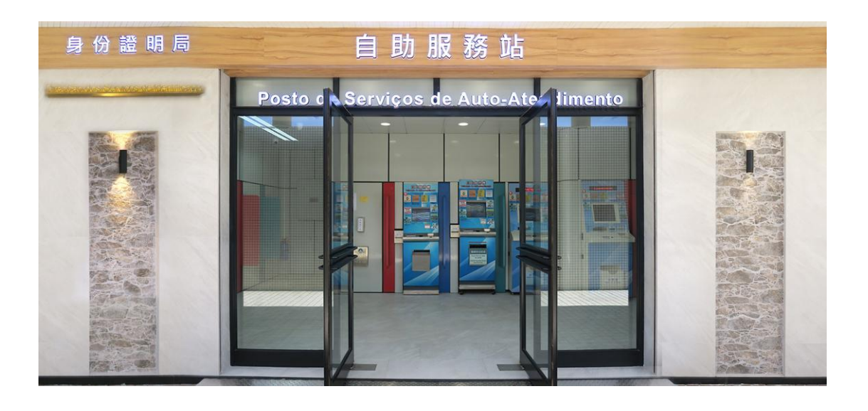
DSI Self-Service Station